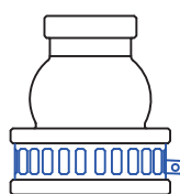
Model : FVT